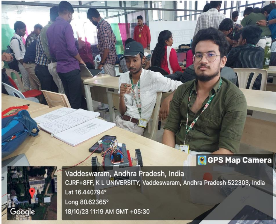
Design Contest on the Robot design on 18/10/2023