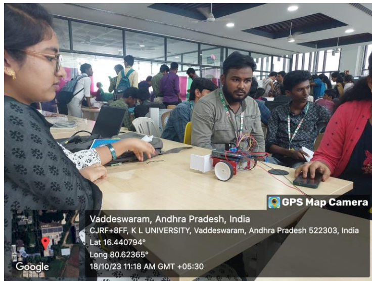
Design Contest on the Robot design on 18/10/2023