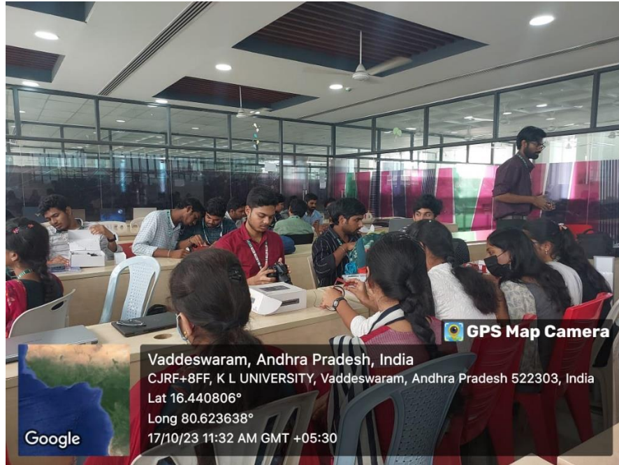
Students designing Soccer Robot using NI myRIO